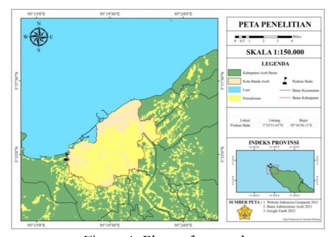
Figure 1. Place of research.

The existence of a traditional wooden shipyard in the Peukan Bada sub-district has the potential to be developed in the future. The selection of a traditional shipyard development strategy is a complex problem, this is because several alternative strategies must be chosen but each alternative contains several criteria that must be assessed based on priorities (Lumaksono, 2014). Therefore, research is needed the study the development of fishing shipyards in Peukan Bada District, Aceh Besar. Research conducted by Sari (2021) says that the fishing shipyard business will continue to run well when the demand from consumers and producers can be fulfilled. The sustainability of the shipyard business is influenced by several factors, including the availability of raw materials, the price of raw materials, the presence of external parties who become competitive, and regulations governing the shipyard business.